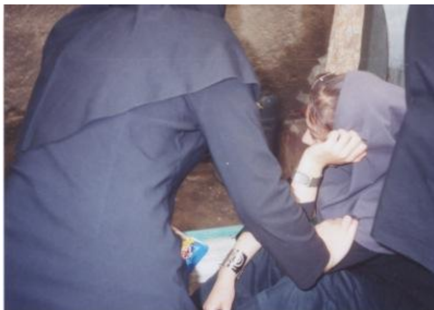
Figure 6: A girl is comforted by her friends after the 'tragedy' breaking up with her boyfriend

for fun? Or is it for pleasure? Why don't they do their homework and respect their parents? Aren't they scared of their parents? I know, they are not. Well at least they should be scared of God. All these things are a sin. I would like you to take my points into consideration. If you benefit from this, it is good, if not..."