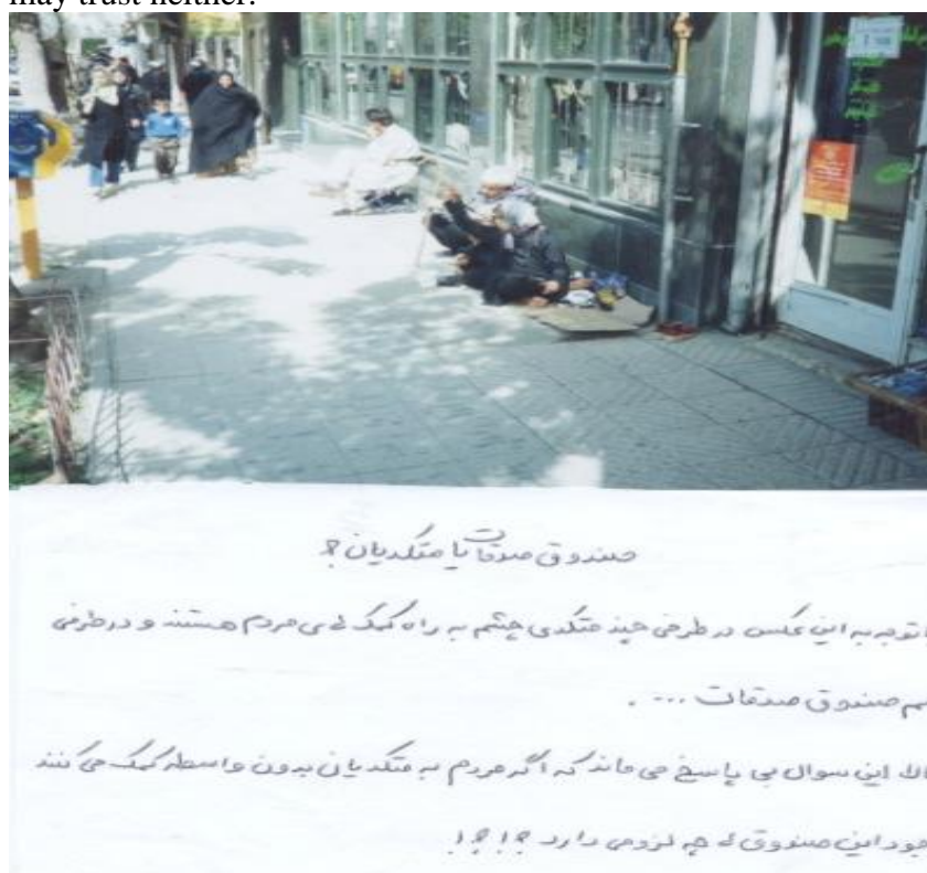
Figure 4: 'In this photo you see a blind couple begging. Opposite them, on the left-hand side of the image, is a blue charity box from the Imam Khomeini Centre. The photo caption reads 'If people are helping the street beggars why do we need the boxes?!?!'

The young participant who prepared this piece conducted a number of interviews with police, the Imam Khomeini Charity staff, social services staff and members of the public. However, instead of incorporating this work visually into her project, she chose to photograph the phenomenon as it is visible in Mahabad's streets. In photo (Figure: 4) you see a blind couple who work in a pair in Mahabad's busy high street. They are positioned next to a bank. Opposite them, on the left-hand side of the image, is a blue charity box from the Imam Khomeini Centre, where people are asked to donate by dropping coins. The young photojournalist argues the point that passersby do not trust the charity because they believe that donations will not be spent on poor people but instead goes to the government to be used for other purposes. She has asked police officers, in her interviews, why they do not deal with the 'problem' by removing people from the streets according to the law. She seems to be suggesting, with this ironic critique, that the state does not do enough to ensure the issue is dealt with, which results in very public displays of poverty that are unpleasant for middle class residents. At the same time, she describes how prospective donors don't trust the beggars; however despite this, as matter of choice, residents would prefer to give money to the beggars themselves rather than the government system, although they may trust neither.