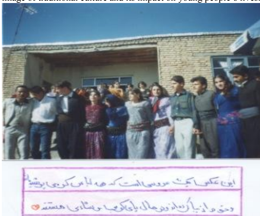
Figure 2: 'this is a photo of a wedding, everyone wearing Kurdish clothes and they made themselves beautiful, they are happy and dancing'