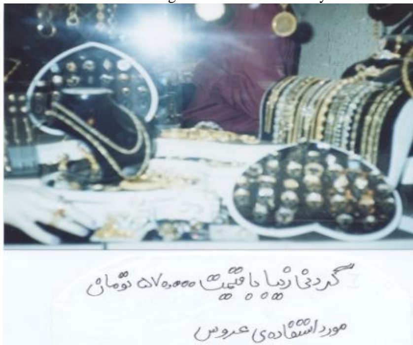
Figure 1: 'A beautiful bride's chain worth around £360 '

In the next photograph (Appendix:2) we see a girl in a red dress, her head absent from the image, and her hands placed prominently on her lap, revealing the many gold