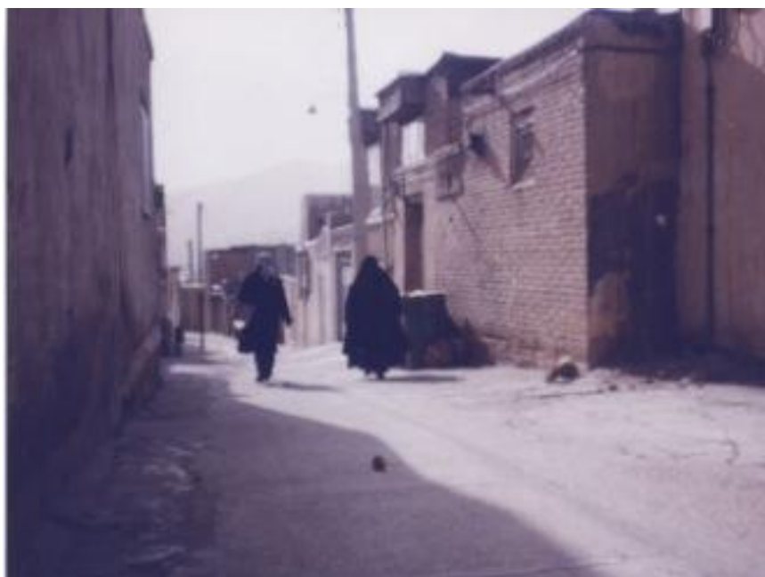
Figure 7: Girls are discouraged from going out in public alone, especially on ‘dangerous’ empty streets

She also tries to show the ‘fear’ faced by women in public space, for example in photo (Figure: 7), taken possibly on a hot afternoon when most people are resting after lunch. The image is striking and has a certain poetry to it, with the empty street and the backs of the chador clad retreating women facing us down the grey and desolate road. Her caption reads “Young girls cannot appear in public at times like this, as it is not regarded as safe and they should be accompanied by another person. Boys however do not face such limitations”. In photo (Appendix: 13) she continues with this line, noting that girls did not allow her to show their faces in the photograph while she was interviewing them. Here we see a small huddle of the photographer herself asking two more girls questions, again their backs to the camera and wearing all black. She comments that “girls don’t allow you to take their photos because they feel they need permission from their families”.