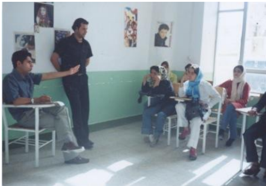
Figure: 3 Young girls (right) interview some local celebrities (left). The performers wear the latest Bollywood styles of dress and hair, and the room is decorated with posters of pop stars

Mahabad society. As the days passed, the girls grew very self-confident in dealing with these boys, and on one occasion invited their “subjects” to attend the Kanoon workshop as a way to ‘show off’, as well as at the time of the exhibition, when they were noticeably pleased to be in their company, guiding them through the hall as other girls watched. (See appendix text/Kurdish 18)