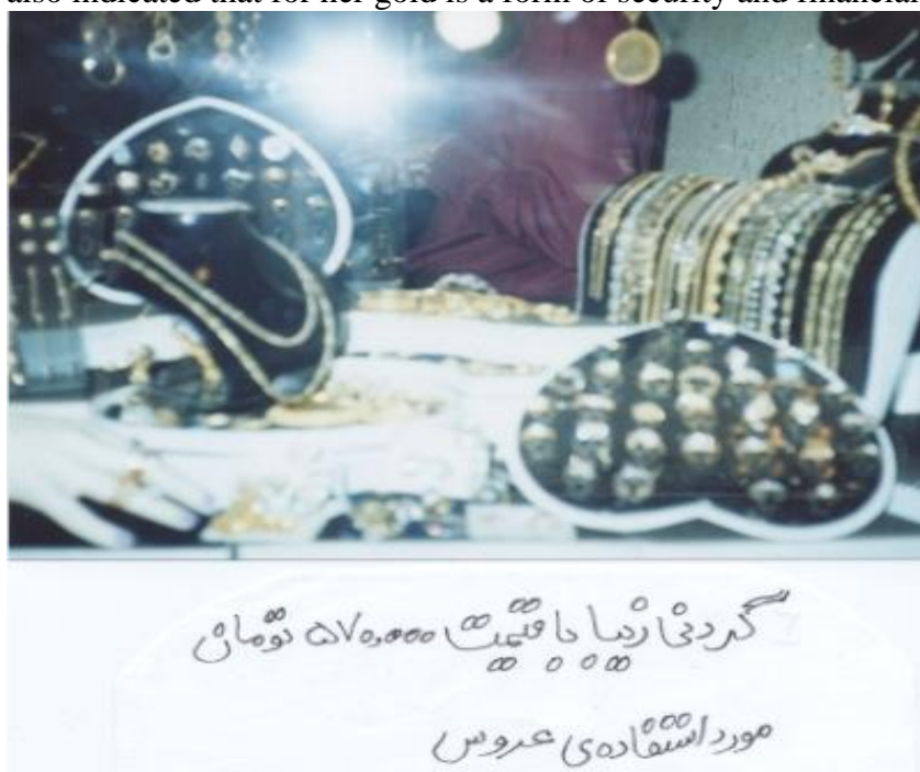
Figure 1: 'A beautiful bride's chain worth around £360 '

In the next photograph (Appendix:2) we see a girl in a red dress, her head absent from the image, and her hands placed prominently on her lap, revealing the many gold