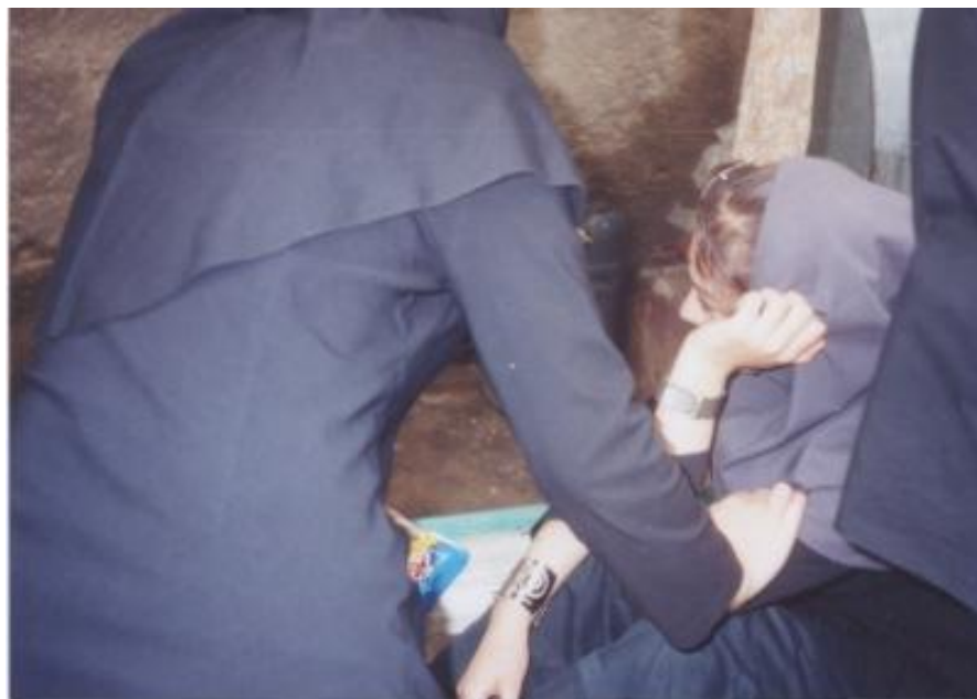
Figure 6: A girl is comforted by her friends after the 'tragedy' breaking up with her boyfriend

for fun? Or is it for pleasure? Why don't they do their homework and respect their parents? Aren't they scared of their parents? I know, they are not. Well at least they should be scared of God. All these things are a sin. I would like you to take my points into consideration. If you benefit from this, it is good, if not..."